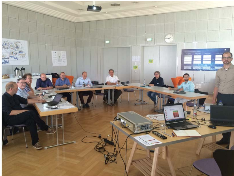
Glimpse into the risk assessment workshop in Karlsruhe.