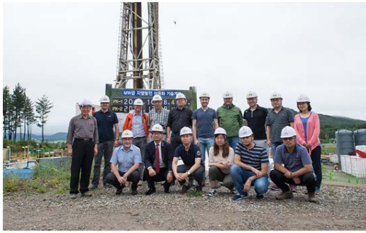
Visitors at the Pohang EGS site.